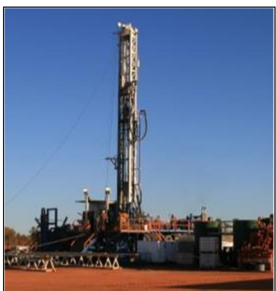
Victory 1 Location Map Atlas Rig #2