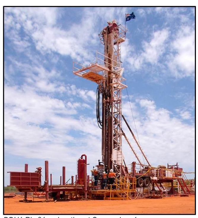
DDH1 Rig 31 on location at Commodore 1