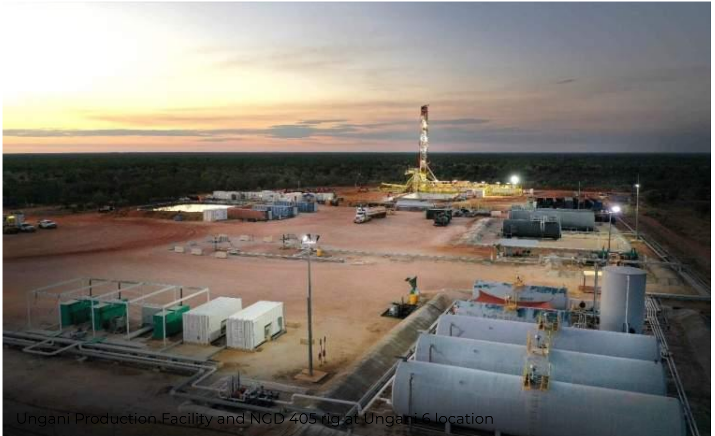
Ungani Production Facility and NGD 405 rig at Ungani 6 location

The initial Ungani 6 drilling operations with the NGD 405 rig are expected to take some 20 days.