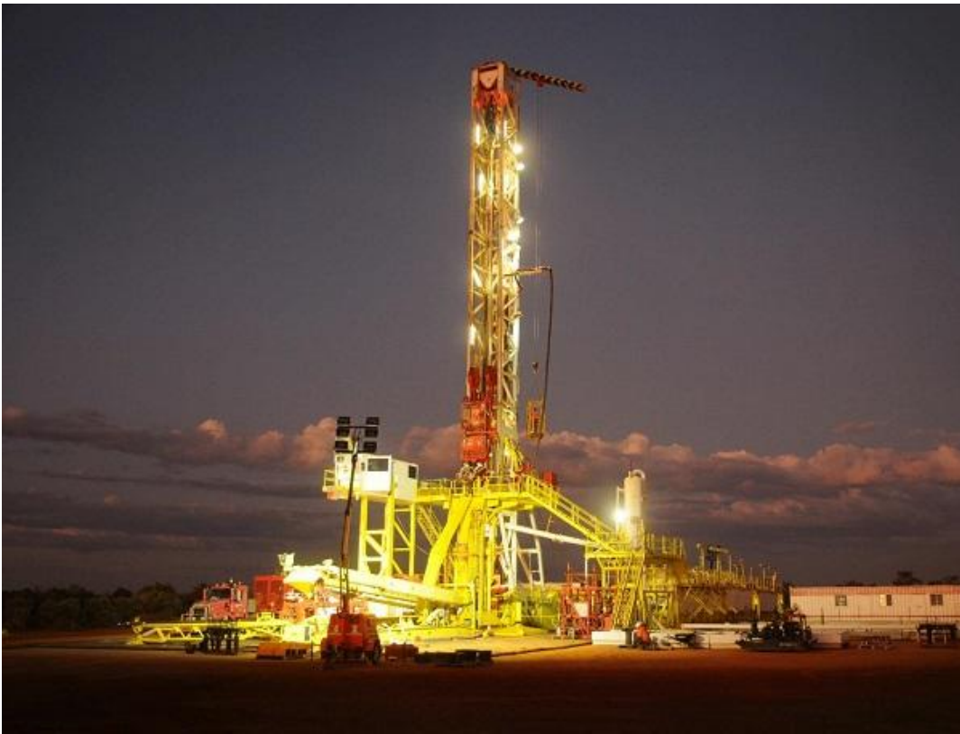
NGD 405 rig at Ungani 6 location

Buru Energy and Roc Oil (Canning) Pty Ltd each have a 50% equity interest in the well and in L20.