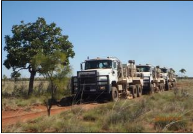
Seismic vibrators at Commodore West survey