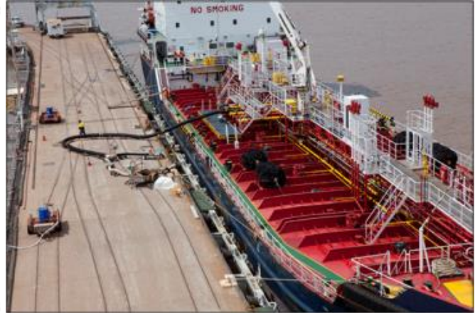
Load out of Ungani crude at Wyndham Port