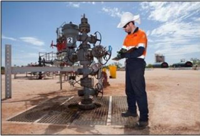
Ungani 2 well head and Buru Energy field operator

Subsequent to the Phase 1 workover of Ungani 1ST1, the overall average field production rate is currently being constrained to ~1,250 barrels of oil per day which is the most efficient rate with the current transportation configuration. Further production testing and pressure monitoring of both Ungani 1ST1 and Ungani 2 will be necessary to calibrate the dynamic modelling of the field, with the well performance currently exceeding modeling predictions.