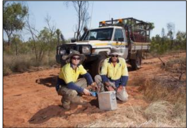
Seismic line crew