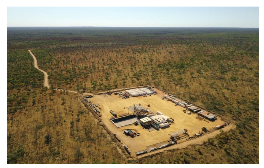
Ensign Rig 963 rigging up at the Currajong 1 location

The mobilisation of the Ensign 963 rig from the Kyalla location in the Northern Territory to the Curraiong location some kilometers east of Broome is now complete with the rig currently being rigged up, and third party inspections underway.