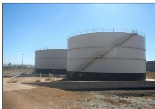
Wyndham storage tanks