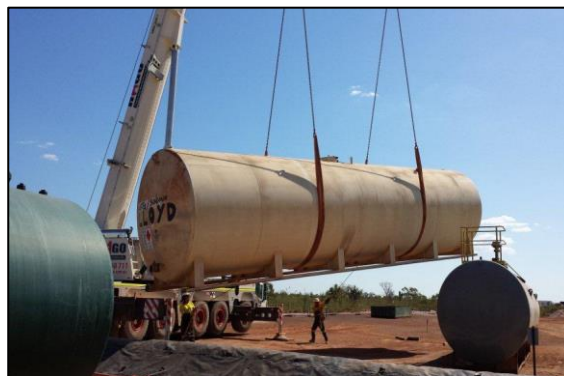
Ungani Field facility activity