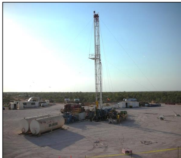
Enerdrill workover rig on location at Ungani

The Enerdrill workover rig, which is being used to prepare the Ungani 1 and 2 wells for commencement of the extended production test, successfully completed the Ungani 2 workover with a cement plug installed to isolate the bottom water in the well. The workover on the Ungani 1 well has also commenced. The modifications to the wells are aimed at providing a better understanding of the full production potential of the reservoir, to support plans to build up to target production rates, and to also provide water recycle capability. This is an environmentally and operationally attractive solution which combines disposal of produced water with testing of the injection performance of the reservoir water zone.