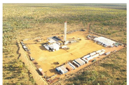
Currajong 1 Location

In light of the current general COVID19 situation in Australia, Buru and its contractors have put in place appropriate protocols and controls to manage the situation and comply with all Government directions. Under current restrictions there is not expected to be any material disruption to the program, but the situation is being closely monitored.