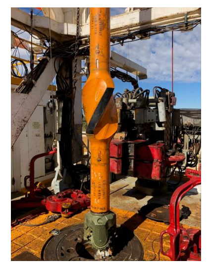
Currajong 1 spud assembly