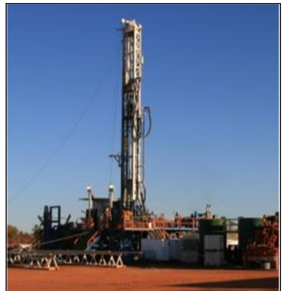
Atlas Rig #2