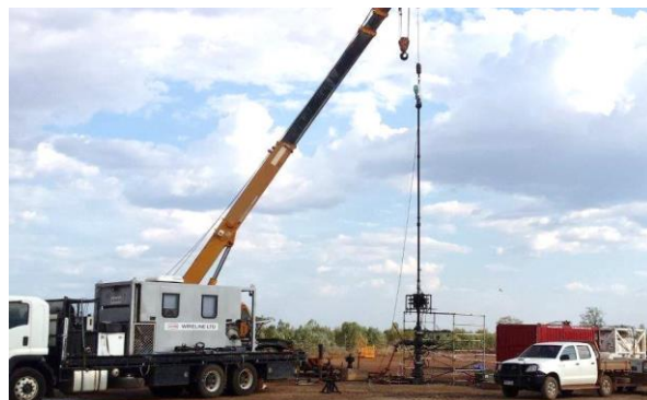
Ungani North 1 well testing operations