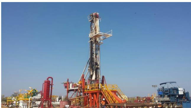
DDH1 Rig 31 on location at Ungani North 1

Subsequent to the running of the completion string in the well with DDH1 Rig 31, some 30 metres of Ungani Dolomite section over the interpreted oil column of approximately 46 metres was perforated for production testing. The perforation was carried out with the well underbalanced with a nitrogen cushion. The nitrogen lift operations established fluid influx into the well at relatively low rates. The fluid recovered was indicative of drilling fluid filtrate from the original drilling operations and is therefore not diagnostic as to potential reservoir recovery. The results need to be fully evaluated before further testing, and consequently the well was temporarily suspended while the results are evaluated and a forward program agreed with the Joint Venture. The forward program is likely to include pumping the well to attempt to remove the drilling fluid and ascertain the nature and flow characteristics of the formation fluid.