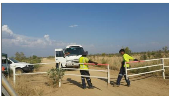
Koolkariya rangers undertaking access control