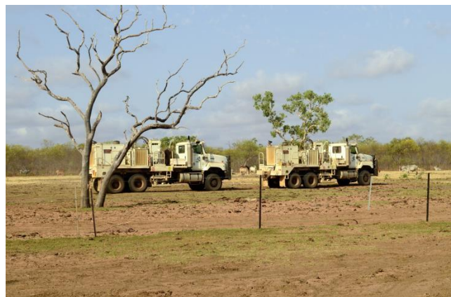
Jackaroo seismic operations – Seismic vibrators