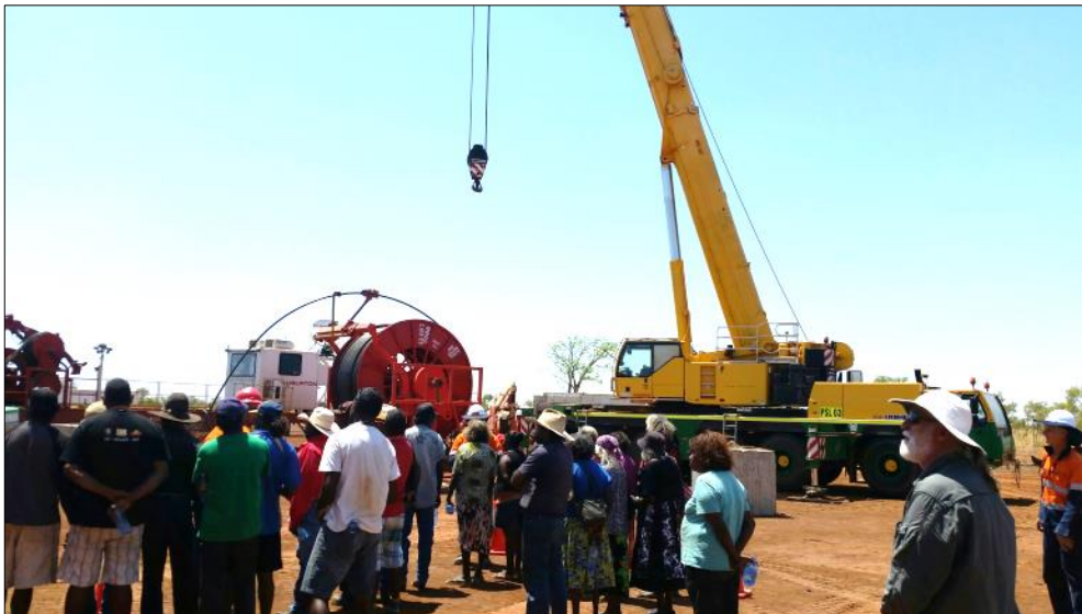
Yungngnora community members inspecting coil tubing operations

Members of the Yungngnora community will remain actively involved in the program including during the main frac program planned for this year.