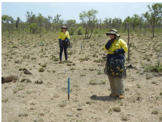
Jackaroo seismic operations – Terrex line crew

The survey lines were prepared using techniques that minimise disturbance to vegetation. Buru Energy staff and management, together with the seismic contractor for the survey, Terrex Seismic, have developed and refined these techniques over many years of operations in Western Australia and they have been recognized as leading practice in environmental management. Current assessments indicate that the Company's seismic lines have strong regrowth after two wet seasons. The operations are also overseen by the Western Australian Department of Mines and Petroleum who require submission and approval, and subsequent adherence to, a rigorous environment plan which is then monitored and audited during operations. These environment plans are publicly available documents.