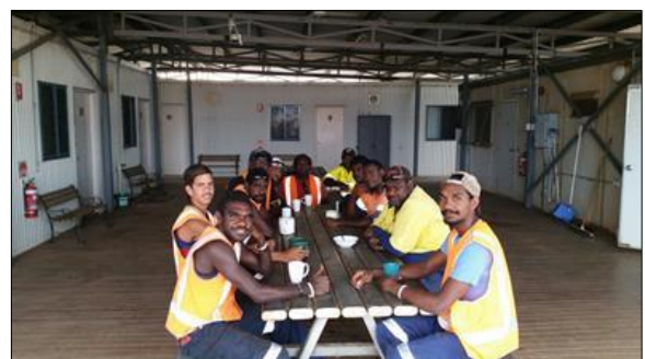
Community workforce at 5am toolbox meeting