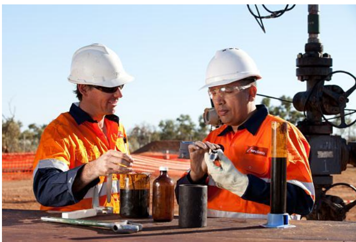
Sampling oil from Ungani-1

Both wells have been performing at or above expectations, with no evidence of pressure depletion or formation water production. Data recovered from the extended production test to date is extremely encouraging with combined flow rates of in excess of 3,000 bopd being recorded from the Field on test. The operating system is working effectively, with very few operational issues or production interruptions.