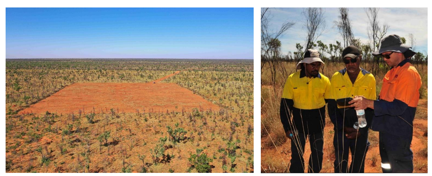
Site works Rafael location

In order to ensure that the prospect is drill ready at the conclusion of the Yakka Munga 1 drilling operation, the access road and drill pad is being constructed and the long lead items for the well have been sourced. As with all Buru's operations, all ground disturbing activities have been carried out under the on site supervision of Traditional Owner heritage monitors.