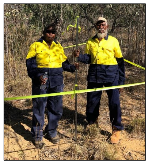
Site works Yakka Munga 1