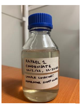
Condensate sample from first

For illustration, a field development with a production rate of 100 million cubic feet of gas per day, would potentially yield 4,000 barrels a day of condensate based on the initial well test data.