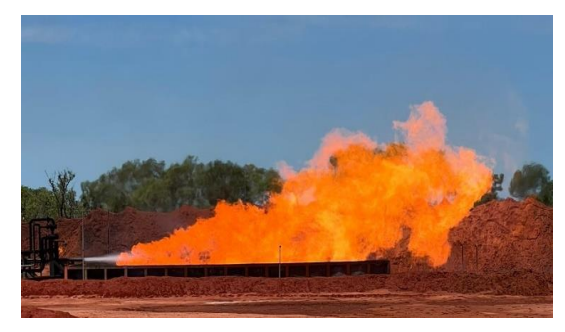
Rafael 1 flow test during March 2022

Final details of the program are under review internally and by the Joint Venture, and will also require the usual regulatory approvals.