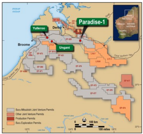
Paradise-1 Regional location map