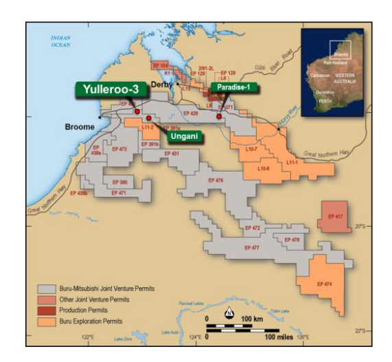
Yulleroo-3 Regional location map