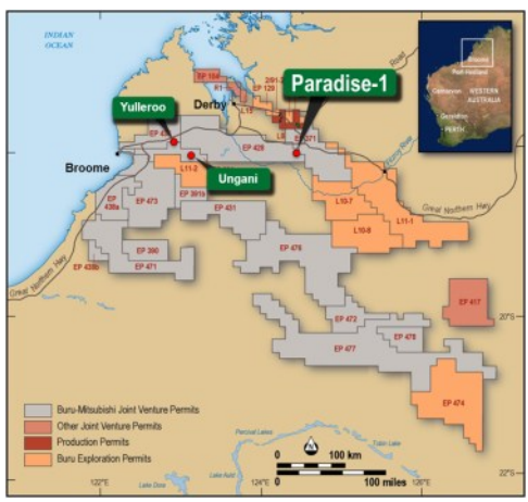
Paradise-1 Regional location map