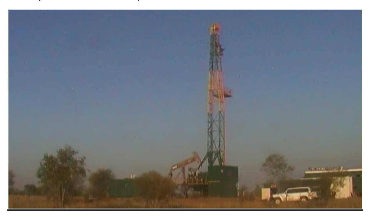
Fairway Rig on site at Sundown oilfield

Following the Sundown oilfield workovers, the Fairway Rig will be mobilised to the Yulleroo-2 well site and will install a 2% inch tubing string in the well. This is designed to increase lift efficiency and assist in the clean-up of Yulleroo-2.