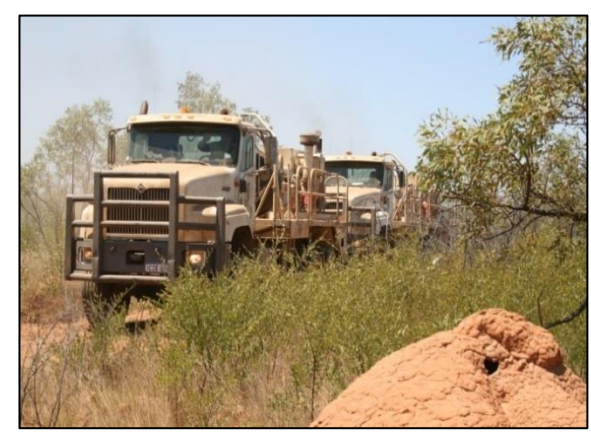
Ungani 3D seismic acquisition