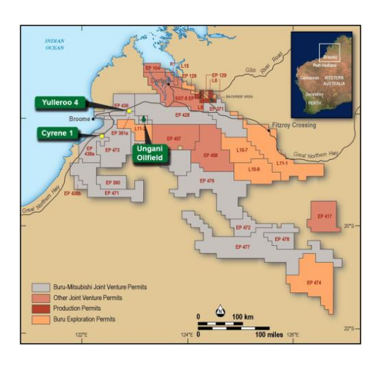
Yulleroo 4 Regional Location Map