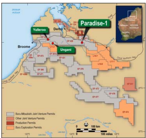
Paradise-1 Regional location map