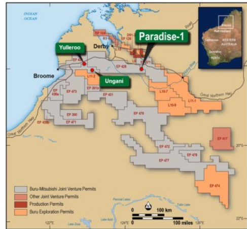
Paradise-1 Regional location map