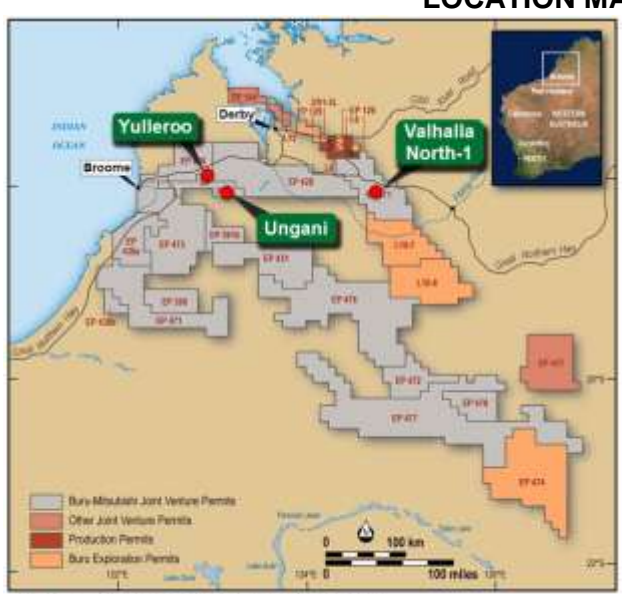
Valhalla North-1 regional location map