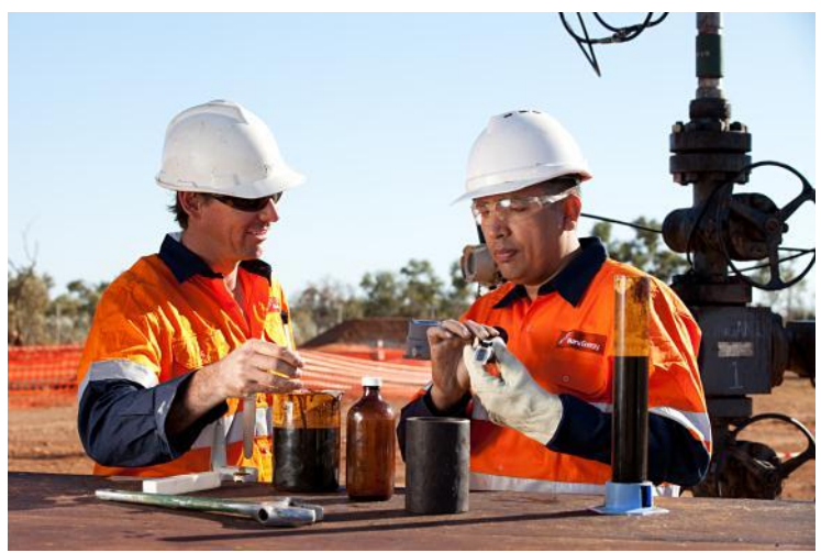
Sampling oil from Ungani-1

Both wells have been performing at or above expectations, with no evidence of pressure depletion or formation water production. Data recovered from the extended production test to date is extremely encouraging with combined flow rates of in excess of 3,000 bond being recorded from the Field on test. The operating system is working effectively, with very few operational issues or production interruptions.