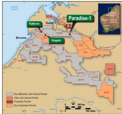
Paradise-1 Regional location map