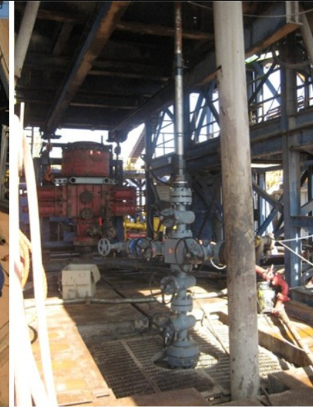
Ungani-1ST1 well head christmas tree